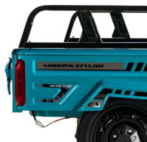
Upto 300Kg Load Carrier